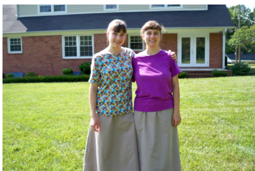
Faith and Hope

Greetings from North Carolina in the name of our Lord Jesus Christ! We're pleased to share with you what the Lord has been doing in our lives and ministry.