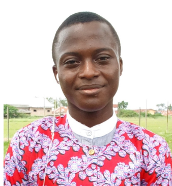
Shadrach in Nigeria