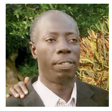
Grace in Uganda