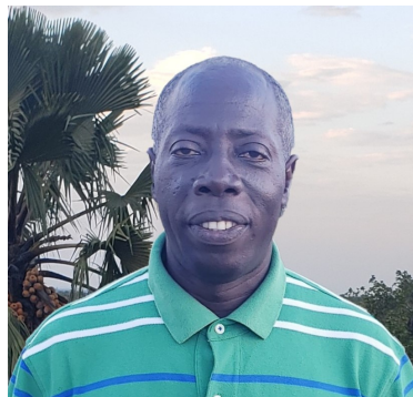
Grace in Uganda