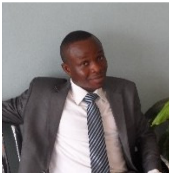
Deji in Nigeria