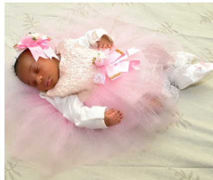
Faith in Nigeria