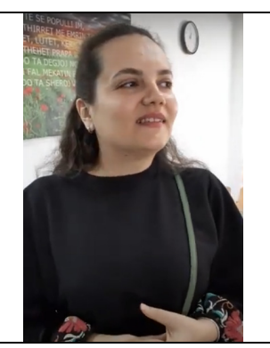
Sofia in Albania