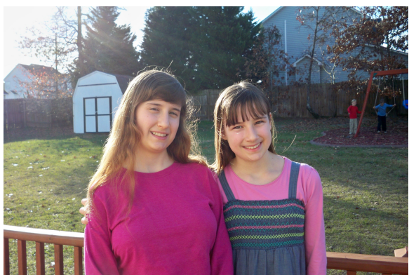
Hope and Faith

Greetings from North Carolina in the name of our Lord Jesus Christ! We're pleased to share with you what the Lord has been doing in our lives and ministry.