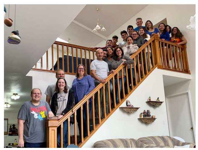
Weekend with couples' group

We saw lots of friends while in Ecuador and we got together for a weekend with people from our couples' group and their kids too.