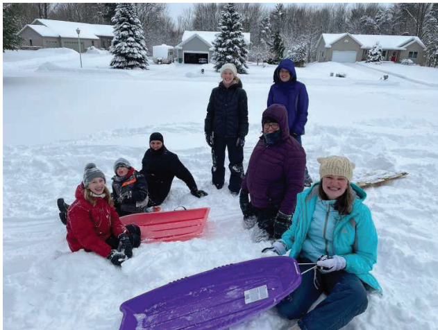
Sledding fun with cousins

For the first time in many years, we are in Michigan in February. This year it is a cold one in the Grand Rapids, Michigan area. The snow is over a foot deep in most places and driving has been an adventure. We enjoy the snow, probably more than those of you who must deal with it each year.