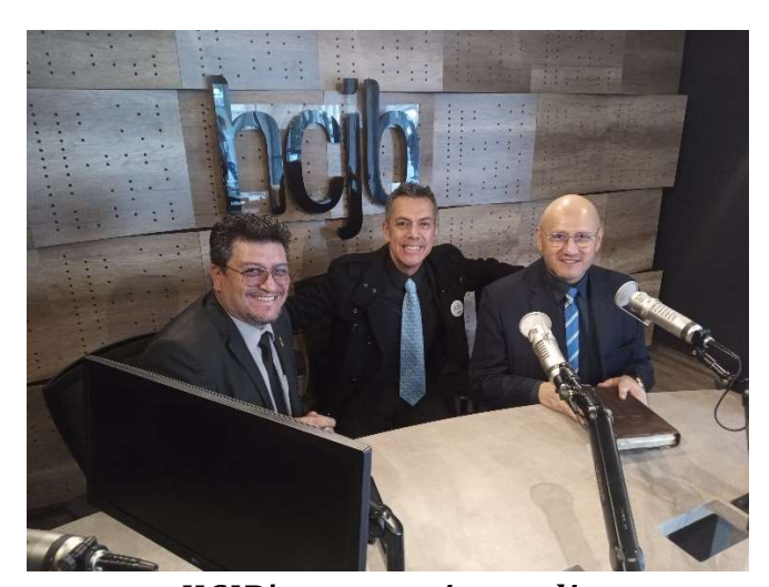
HCJB's new main studio