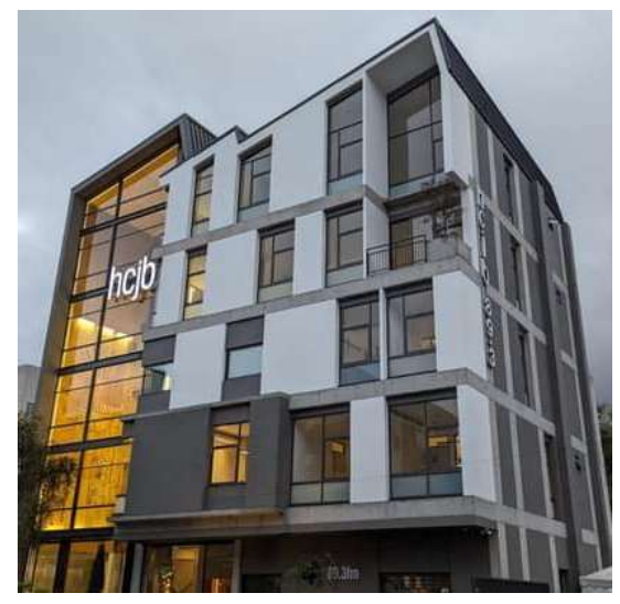
HCJB Ecuador - the new building

Because of the building dedication this year, I (Geoff) had two extra trips to Ecuador. The first was in September to help with some of the building and installation work. And my latest trip was from Oct 24 to Nov 1, and included the building dedication ceremony on Oct 28.