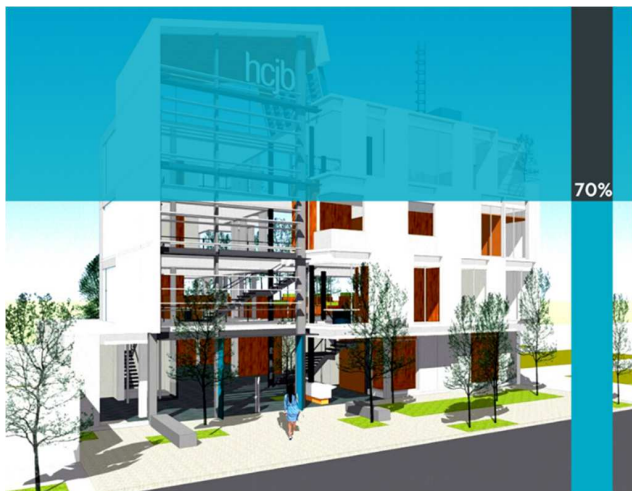
Current building progress

The building project, started in March of 2022, is now 70% complete. We are hoping to move into the building in August of this year. Now we are at the point of needing final definitions on equipment to buy for the new studios and how to install it. Our new studios will be fully digital.