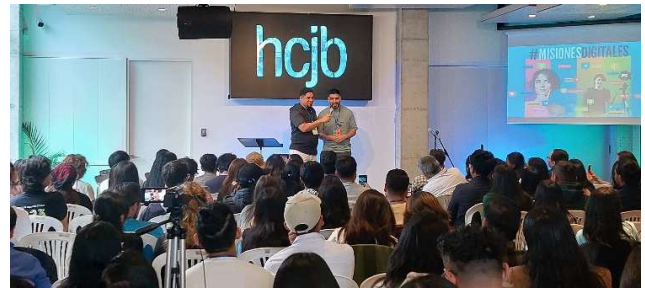
Session at last year's conference

May 2-3, 2025, marks the second Digital Missions Conference, which will take place in Quito, Ecuador at HCJB. Many of the 100 young adults who attended last year are expected to return, and we hope for new participants too.