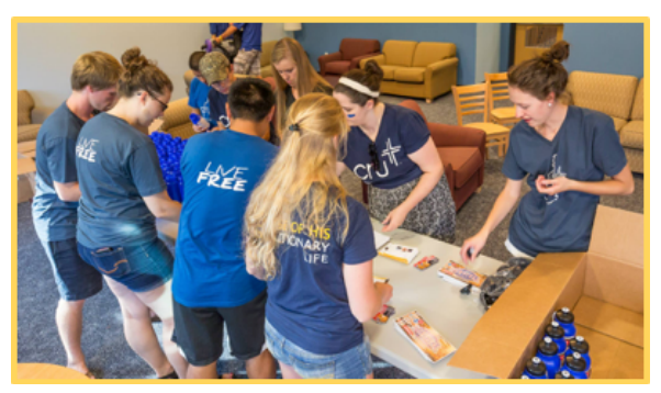
Cru UNH Students prepping water bottles for Freshman Outreach