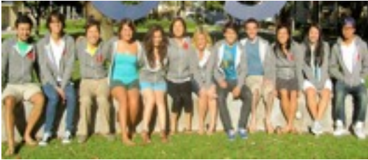
Serving God Whole-Heartedly

“For Christ’s love compels us, because we are convinced that one died for all, and therefore all died. And He died for all, that those who live should no longer live for themselves but for Him who died for them and was raised again. So from now on we regard no one from a worldly point of view. Though we once regarded Christ in this way, we do so no longer. Therefore, if anyone is in Christ, the new creation has come: the old has gone, the new is here! All this is from God, who reconciled us to himself through Christ and gave us the ministry of reconciliation: that God was reconciling the world to himself in Christ, not counting people’s sins against them. And he has committed to us the message of reconciliation. We are therefore Christ’s ambassadors, as though God were making his appeal through us. We implore you on Christ’s behalf: Be reconciled to God. God made him who had no sin to be sin for us, so that in him we might become the righteousness of God.” [2 Corinthians 5:14-21] *theme passage for our summer project*