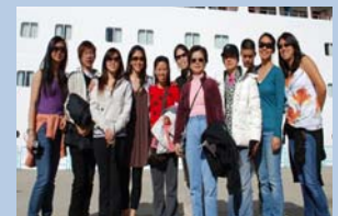
Family cruise to Ensenada