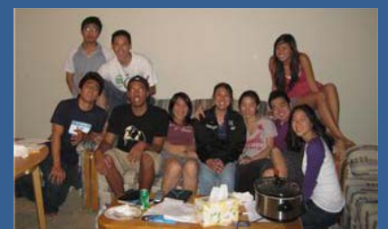
Our very 1 st meeting