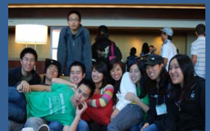
EPIC Conference 2009