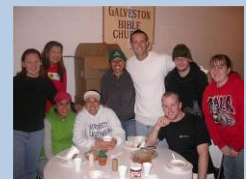
Church trip to Galveston, Texas