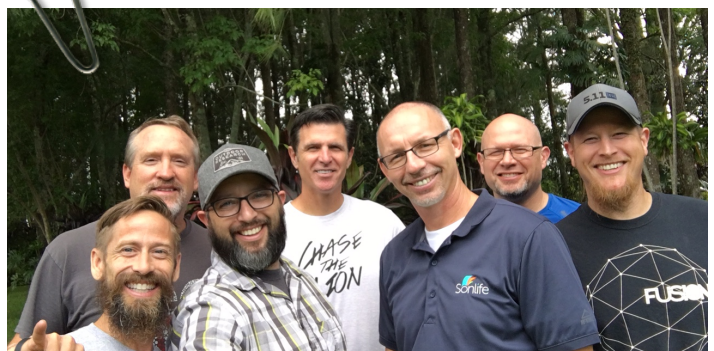
One year ago, our Sonlife Team gathered in Costa Rica... the team has doubled this past year!