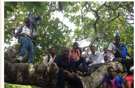
SOYM Students gather in our "Chapel in the Trees"

When we began SOYM, Open Door had only two churches. Today, there are eighteen! And the most exciting part about that growth is that 16 of the 18 churches are being pastored by SOYM graduates! Not only that.... The Medical Center and