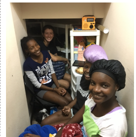
The girls in our "tornado shelter"

Thanks for your generous support, faithful prayers and timely encouragement of our ministry efforts with DHM. We could not do this without you.