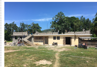
Expanding the Training Center

Would you like to Scholarship one of the Young Leaders in SOYM this year?