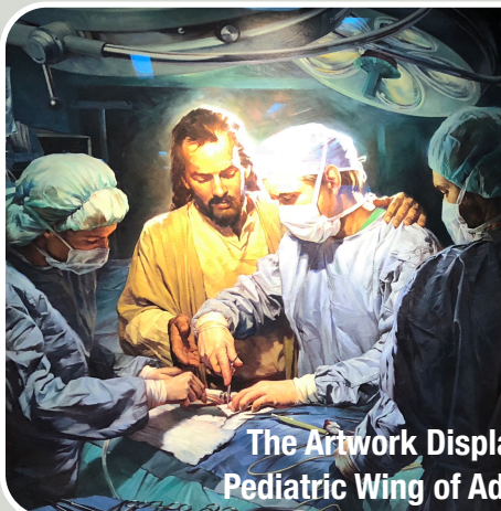
The Artwork Display near the entrance to the Pediatric Wing of Advent Hospital Orlando South.