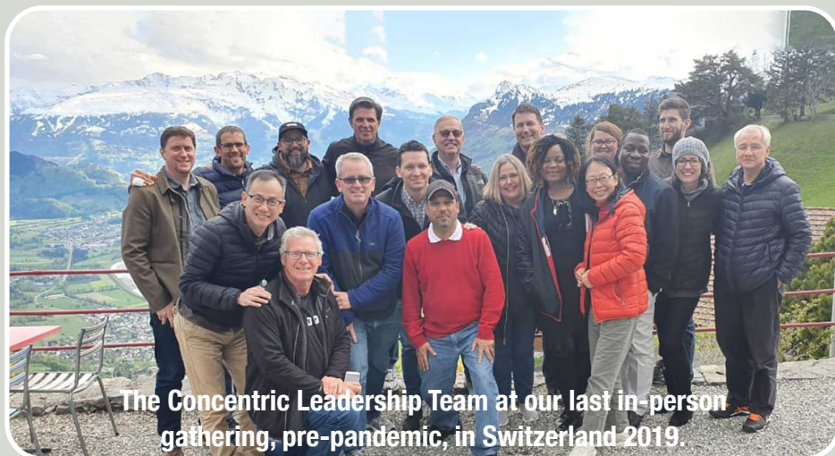
The Concentric Leadership Team at our last in-person gathering, pre-pandemic, in Switzerland 2019.