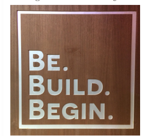
Our Disciple-Making Pathway