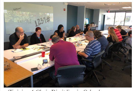
Training 4 Chair Discipling in Orlando.

BE vimeo.com/249748827 BUILD vimeo.com/249761407 BEGIN vimeo.com/249812714