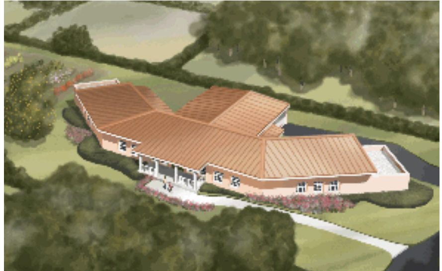
The Original Plans for our Orphanage. Construction began in 2010. Phase One of the Orphanage was completed in December 2011.

While in Haiti the first week of June, I received word that Open Door Haiti would be receiving a $60,000 grant to complete our orphanage!