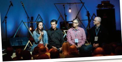
Sonlife's National Disciple-Making Conference in Orlando Jan 9-11