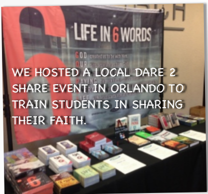
WE HOSTED A LOCAL DARE 2 SHARE EVENT IN ORLANDO TO TRAIN STUDENTS IN SHARING THEIR FAITH.

Paul's words in Romans 1:16 ring true, "I am not ashamed of the gospel of Jesus Christ, because it is the power of God for the salvation of everyone who believes."