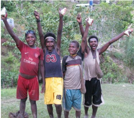
The four prize winners rejoice.