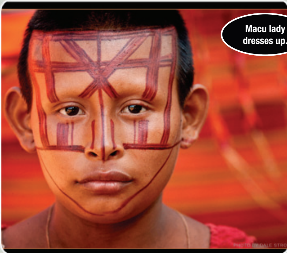
Macu lady dresses up.

Gifts: 1000 E 1st Street, Sanford, FL 32771