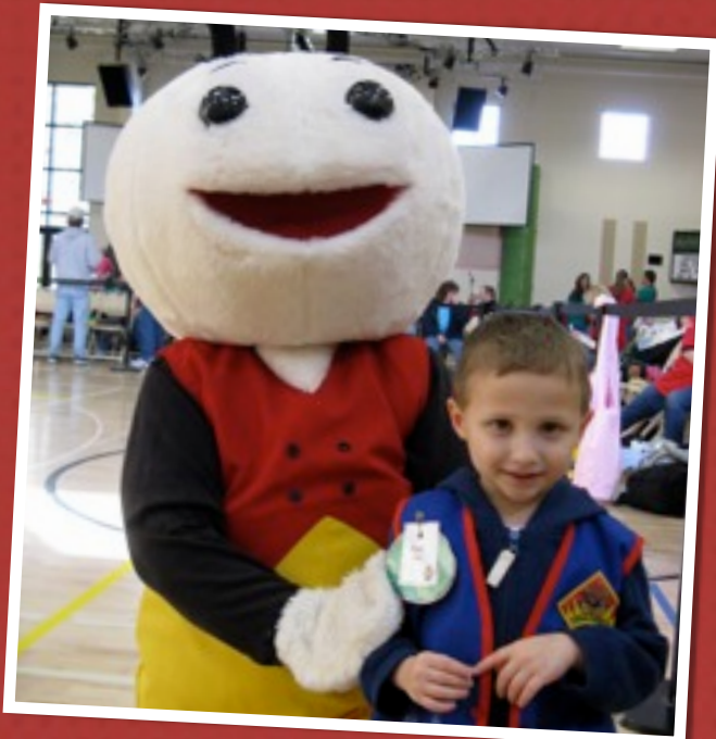
SPARKY MADE A SPECIAL APPEARANCE AT THE AWANAGAMES IN EUGENE!