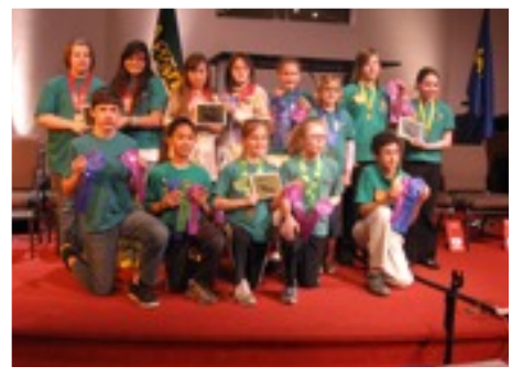
THE BIBLE QUIZ AND AWANAGAMES CHAMPIONS IN SALEM