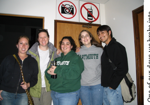
interior. (We were very proud of Our group repainted almost the gation and ministry in Tiberias work groups to help paint and do yard work for a local congr One of our days we broke into entire congregation building ourselves.