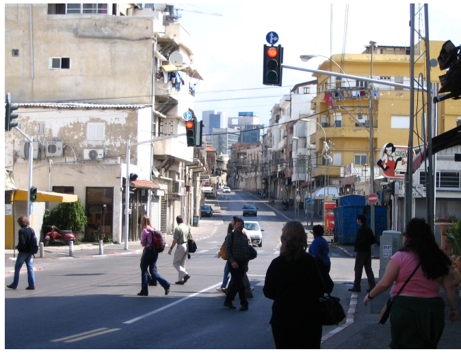
We began our trip in Tel-Aviv/Yafo. This is a shot of us walking to congregation on Shabbat (the Sabbath).