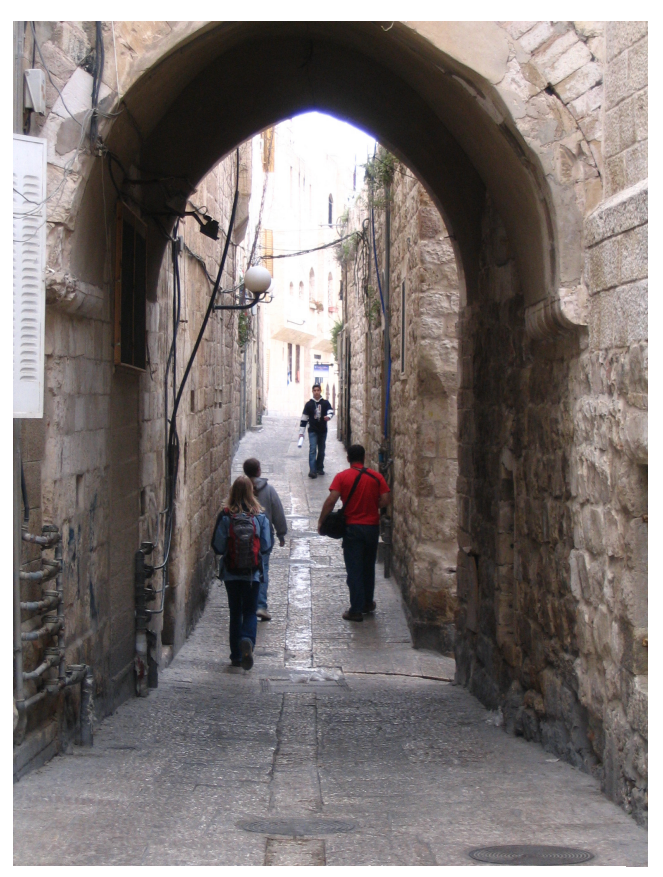
Walking down the streets of the Old City of Jerusalem. This picture is from the Armenian Quarter. There are also Christian, Jewish, and Arab Quarters. The Arab Quarter is by far the largest of the four. The buildings are from around 1400 AD.