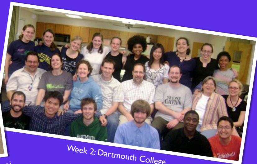
Week 2: Dartmouth College