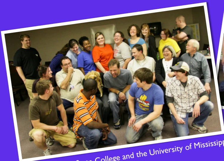
Week 1: Keene State College and the University of Mississippi