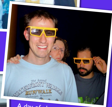
A day of play at Disney after a week of hard work.