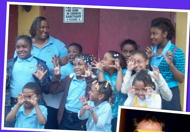
Kids in one of the after-school programs we helped out with. Here they are acting out a Bible verse we taught them.