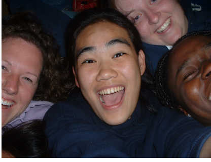
The women I disciplined over the summer in NJ (and me). They all climbed onto my bed for this picture.