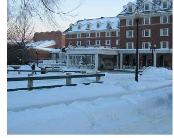
Campus after one of the winter snowstorms.