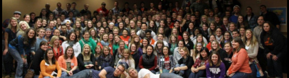
Our students at TCX—from Madison, Whitewater, and Platteville!

Thank you for investing in these students and helping make stories like these possible!