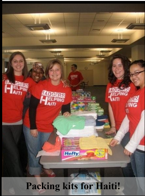
Packing kits for Haiti!