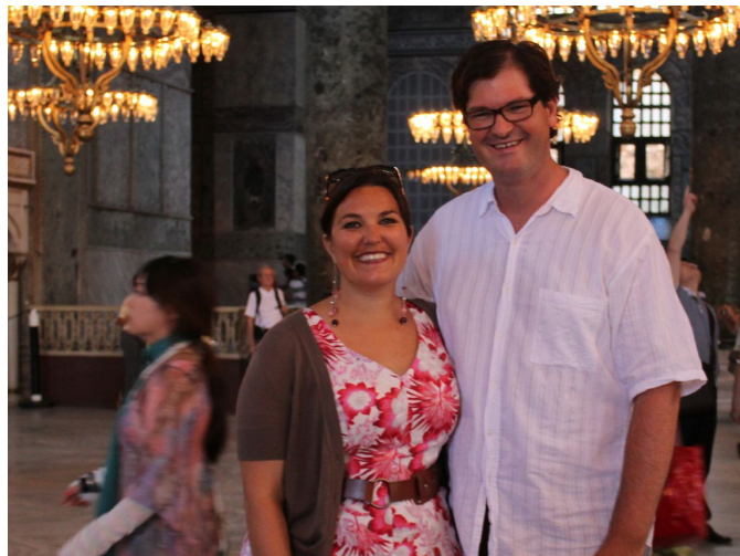
In a former mosque, now a museum— pray for this country.