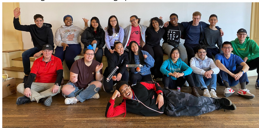
Some of our student leaders at a community service day this weekend