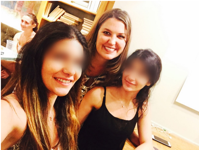
I've blurred their faces for their safety, but don't you love their smiles!

One of the easiest ways to get into conversations these days on campus is to use a stack of 50 images that we