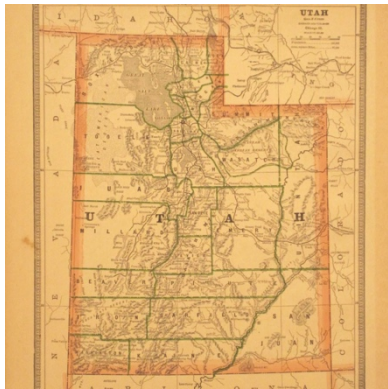
It was so fun to be able to visit many of our friends and supporters in Utah. We loved seeing you all. #blessed