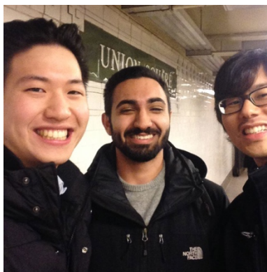
We're praying for a movement of men to raise up at BU (we've got over 100 women involved, but only a handful of guys). Would you pray with us?