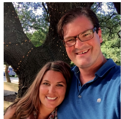
We love you. Loving our adventurous Lord,