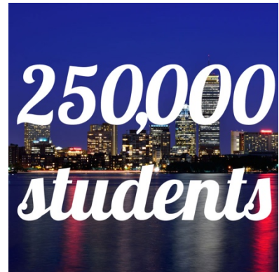
There are 250,000 students returning to Boston in the next week. Pray for spiritual openness & that many would follow Jesus.