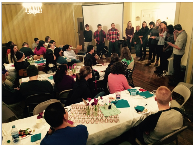
Here are the Insider teams telling their stories to younger students from across Boston.

Another student shared that there's something amazing about sharing the gospel in community. "It is more powerful for 8 of us to be journeying with a group."