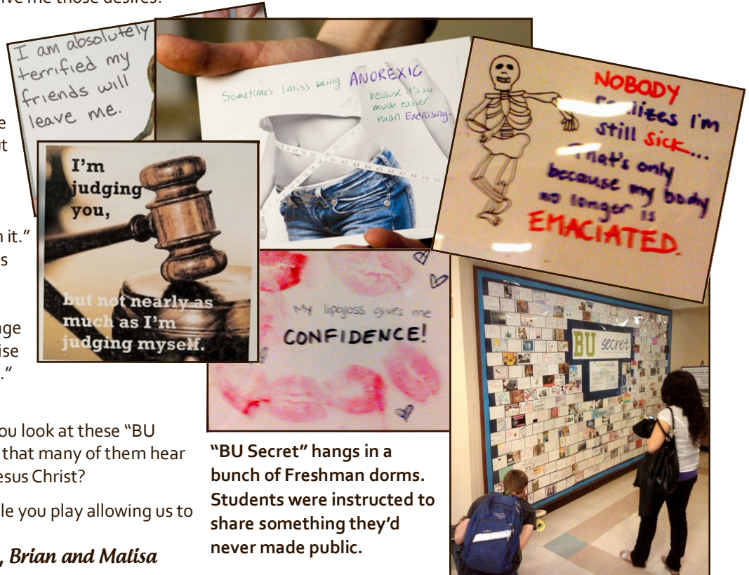
"BU Secret" hangs in a bunch of Freshman dorms. Students were instructed to share something they'd never made public.