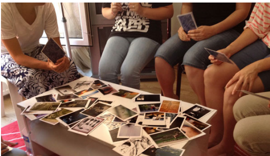
Soularium in our apartment