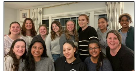
The friends all huddled in my living room