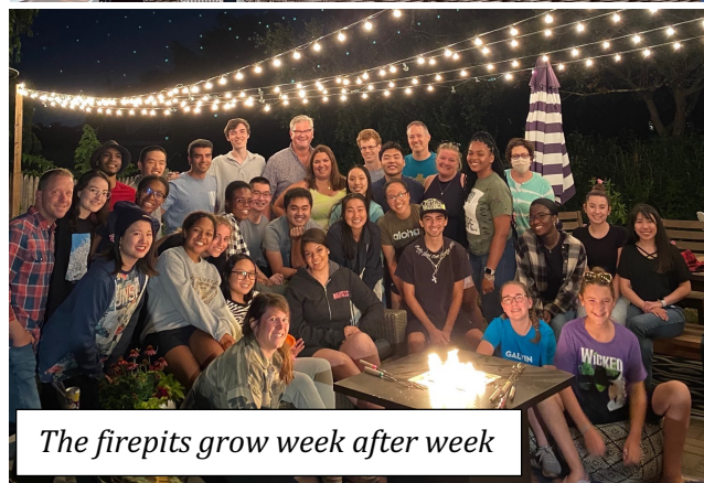
The firepits grow week after week