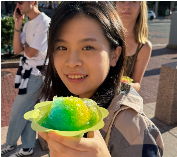
A sweet first taste of Cru