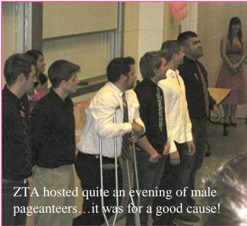
ZTA hosted quite an evening of male pageanteers...it was for a good cause!

Sometimes ministry on campus allows me to experience things for the first time. That's beneficial in keeping me humble and open to new ideas. It also keeps life interesting, like my recent chance to attend a male beauty pageant!