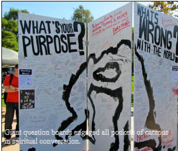
Giant question boards engaged all pockets of campus in spiritual conversation.