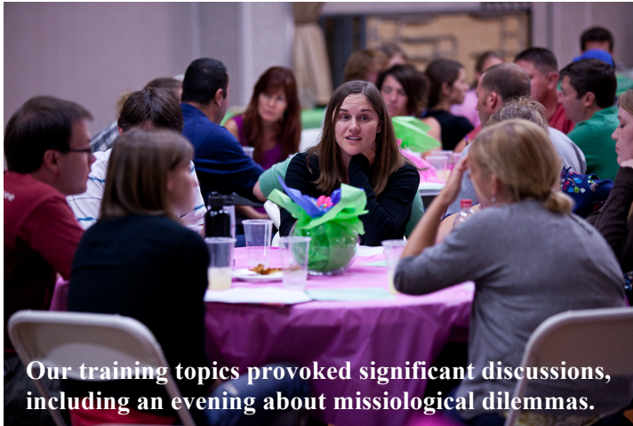
Our training topics provoked significant discussions, including an evening about missiological dilemmas.