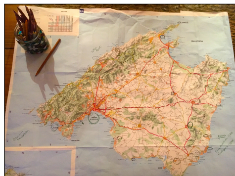
We scouted out the entire island using a paper map. haha!

After four days in Madrid we traveled to beautiful Mallorca. For those of you who do not know, Mallorca is an island off the coast of Spain with a population of about one million. It is a popular tourist destination for Europeans and they