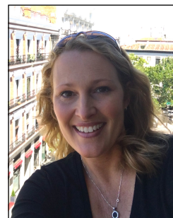
NOW... Spain, 2017