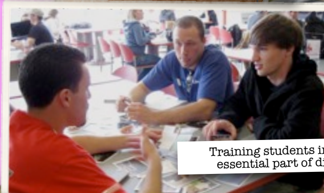
Training students in evangelism is an essential part of discipleship.