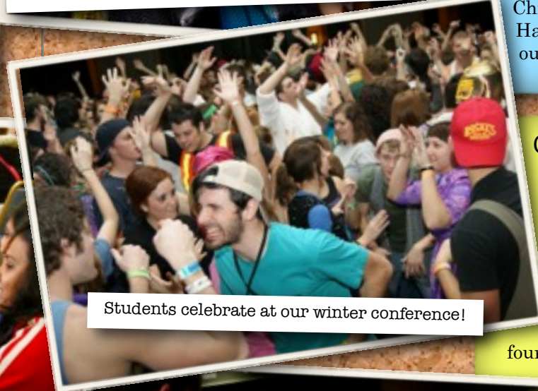
Students celebrate at our winter conference!