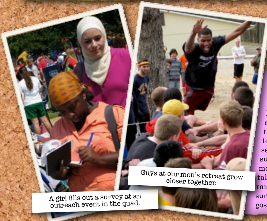
Guys at our men's retreat grow closer together.