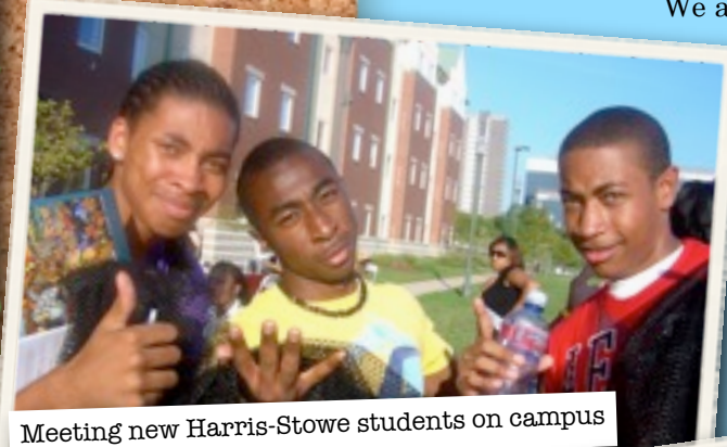
Meeting new Harris-Stowe students on campus