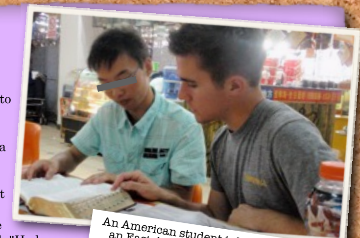
An American student takes time to teach an East Asian student about the Bible.