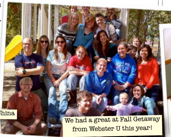
We had a great at Fall Getaway from Webster U this year!