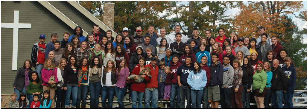
UMassCru Fall Retreat 2011