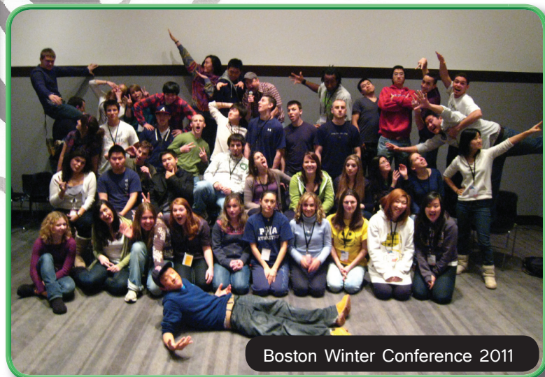
Boston Winter Conference 2011

"I don't know why, but when we went through the booklet again, things really made sense. Especially the part