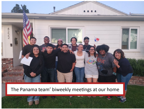
The Panama team' biweekly meetings at our home